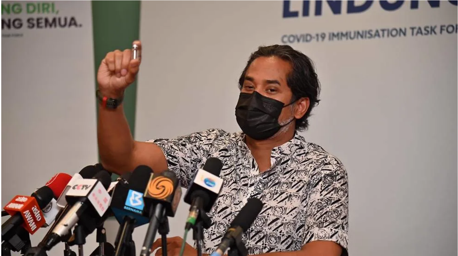
Malaysia's Minister for Science, Technology and Innovation Khairy Jamaluddin.